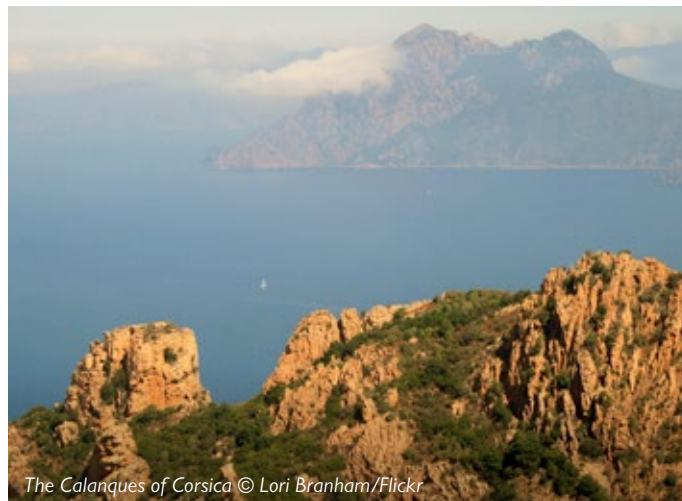
The Calanques of Corsica