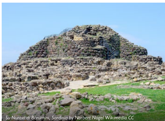
Su Nuraxi di Barumini, Sardinia

Proceed to the UNESCO World Heritage site of Su Nuraxi di Barumini. The complex at Barumini, which was extended and reinforced in the first half of the 1st millennium under Carthaginian pressure, is the finest and most complete example of this remarkable form of prehistoric architecture. Nearby is the Casa Zapata, built over a Nuraghic fort in the 16th century and today a museum in which one can look down through a glass floor into the remarkably well-preserved archaeological remains.