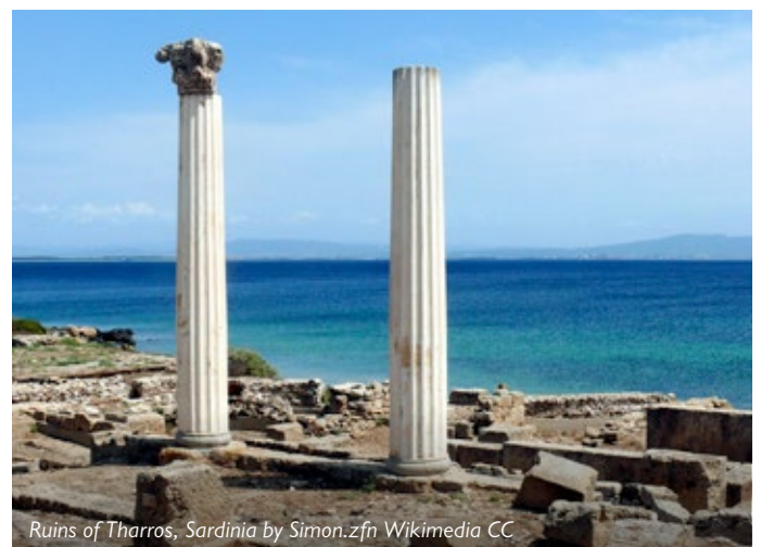
Ruins of Tharros, Sardinia

Enjoy lunch in a picturesque local restaurant and an afternoon walking tour. Late afternoon return to Alghero. B L