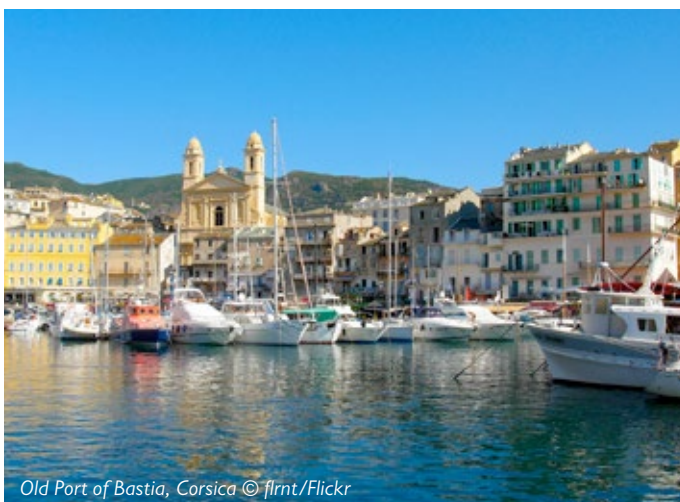
Old Port of Bastia, Corsica

Return to the hotel for late afternoon and evening at leisure. B