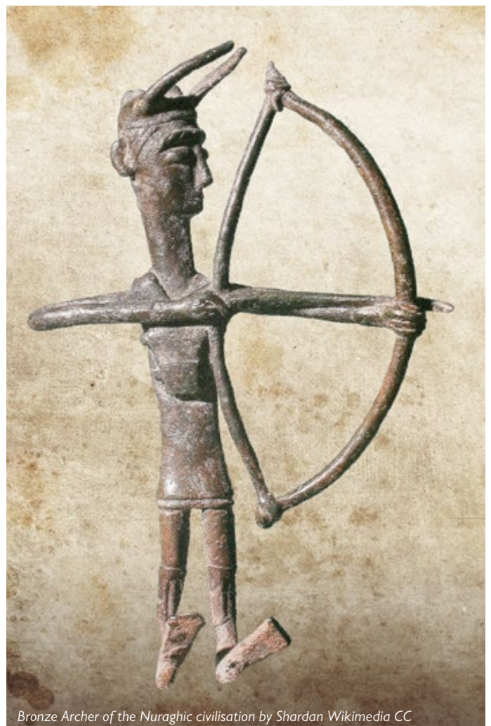
Bronze Archer of the Nuraghi civilisation by Shardan Wikimedia CC

Following earlier Neolithic and Chalcolithic cultures on the island, Sardinia was occupied in the second millennium BC by the so-called Nuraghic civilization: this Bronze-age population may be identical with the mysterious 'sea-peoples' who preyed on Mycenaean, Hittite and Egyptian coastal cities before suddenly disappearing from the historical record or rather, according to this theory, settling in Sardinia. Their most visible remains are the stone tower-forts ('Nuraghi') that are scattered all over the island: there are some 7000 in all, of which 200 have been excavated. They also left a great many evocative bronze statuettes of chiefs, warriors, priests, animals and boats. The Nuraghic civilization came under pressure from the Phoenicians, who established coastal strongholds in the southwest of the island from the 8th century (including Tharros and Karalis, now Cagliari); Phoenician Carthage eventually dominated the island from about the 6th – 5th century BC.