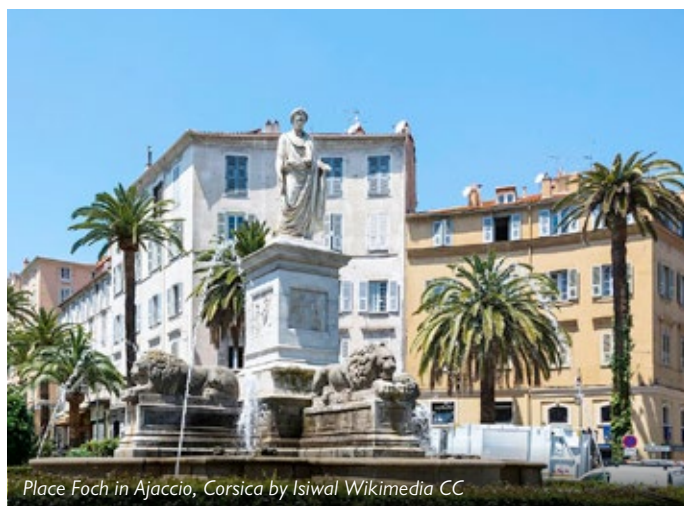
Place Foch in Ajaccio, Corsica