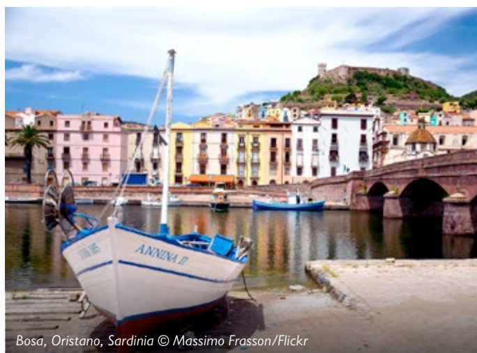
Bosa, Oristano, Sardinia

Tour arrangements conclude with a transfer to Cagliari airport for suggested afternoon flight to Rome to connect on Emirates/Qantas flight via Dubai. B