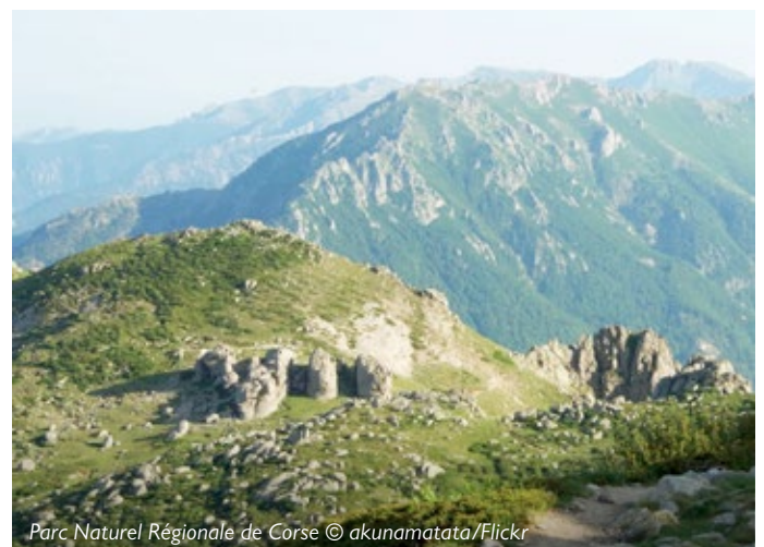
Parc Naturel Régional de Corse