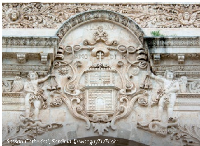
Sassari Cathedral, Sardinia

You can find the full terms & conditions at www.renaissance-tours.com.au/booking-conditions or we would be happy to post you a copy on request.