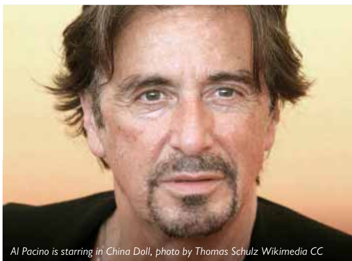
Al Pacino is starring in China Doll