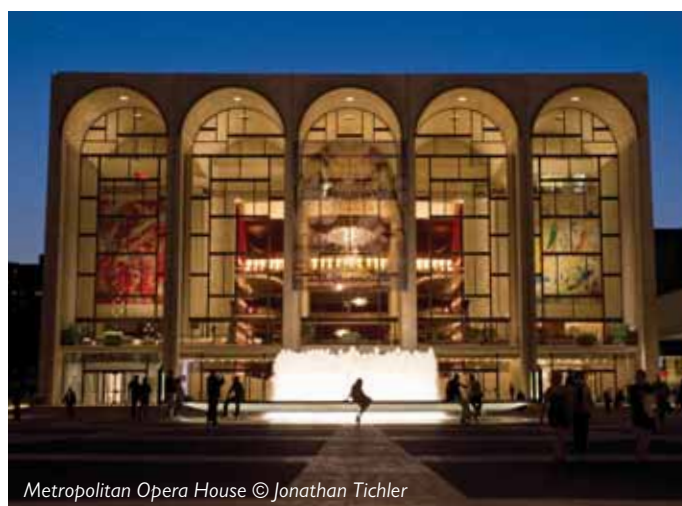
Metropolitan Opera House