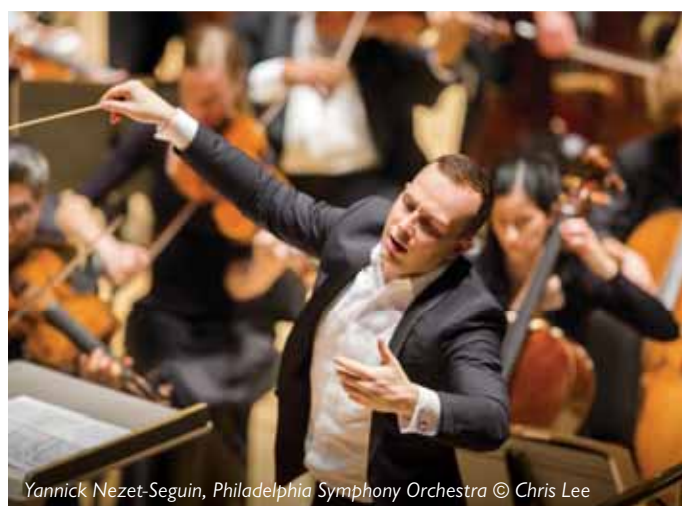
Yannick Nezet-Seguin, Philadelphia Symphony Orchestra