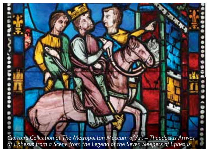
Cloisters Collection at The Metropolitan Museum of Art – Theodosius Arrives at Ephesus from a Scene from the Legend of the Seven Sleepers of Ephesus