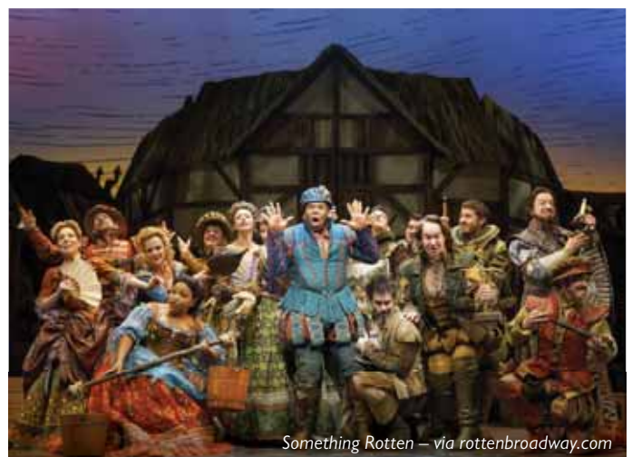
Something Rotten – via rottenbroadway.com