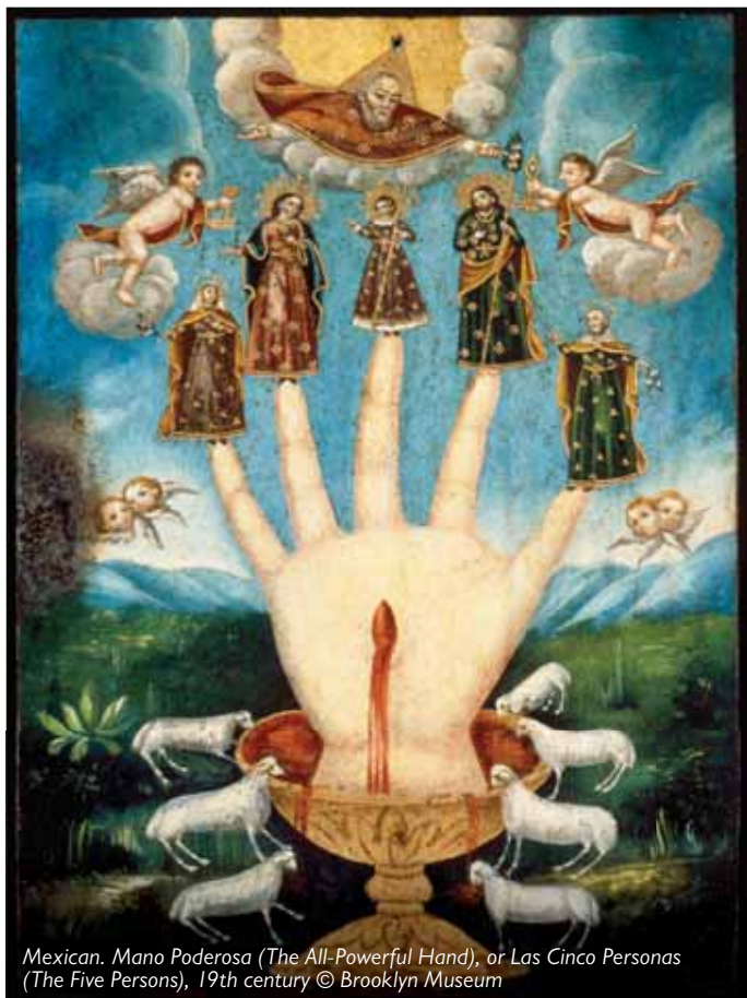
Mexican. Mano Poderosa (The All-Powerful Hand), or Las Cinco Personas (The Five Persons), 19th century