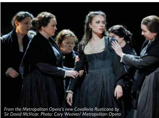
From the Metropolitan Opera's new Cavalleria Rusticana by Sir David McVicar.