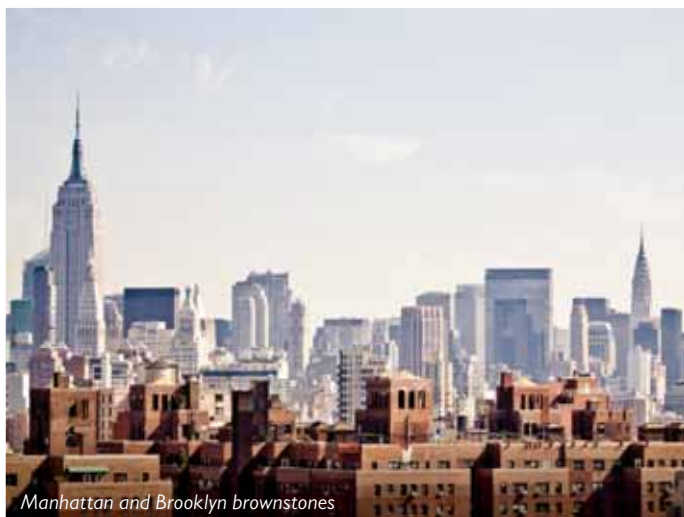
Manhattan and Brooklyn brownstones