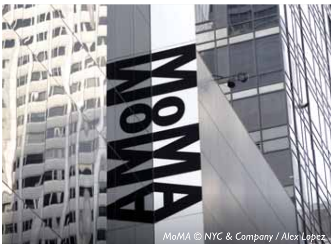
MoMA © NYC & Company / Alex Lopez

Afternoon visit to the magnificent Frank Lloyd Wright-designed Solomon R. Guggenheim Museum located on Fifth Avenue. The Guggenheim is home to one of the world's most integrated collections of modern and contemporary art in one of the greatest modern architectural icons of the 20th century. B