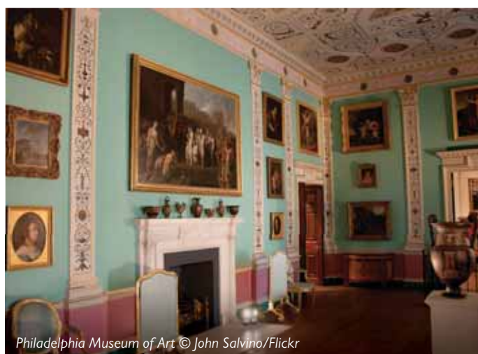
Philadelphia Museum of Art

You can find the full terms & conditions at www.renaissance-tours.com.au/booking-conditions or we would be happy to post you a copy on request.