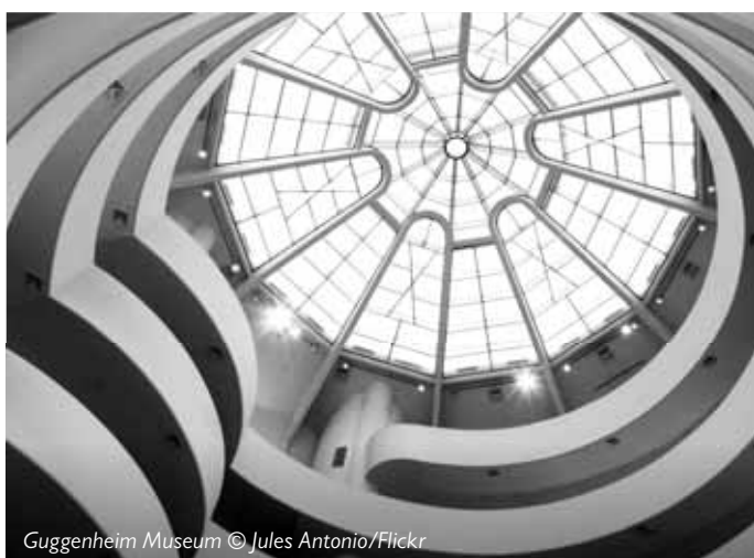
Guggenheim Museum