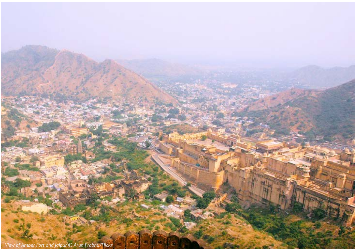
View of Amber Fort and Jaipur