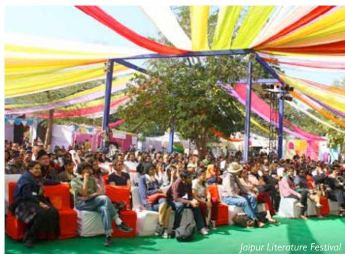
Jaipur Literature Festival

This evening, enjoy dinner at the hotel or local restaurant. (B D)