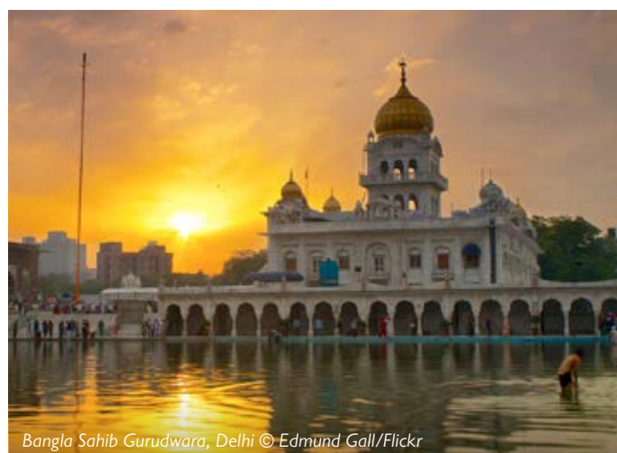
Bangla Sahib Gurudwara, Delhi

Begin your exploration of the Delhi contemporary art scene with a full day visiting the Kiran Nadar Museum of Art. The initiative of the avid collector Kiran Nadar, KNDA is a private museum of art exhibiting modern and contemporary works from India and the subcontinent.