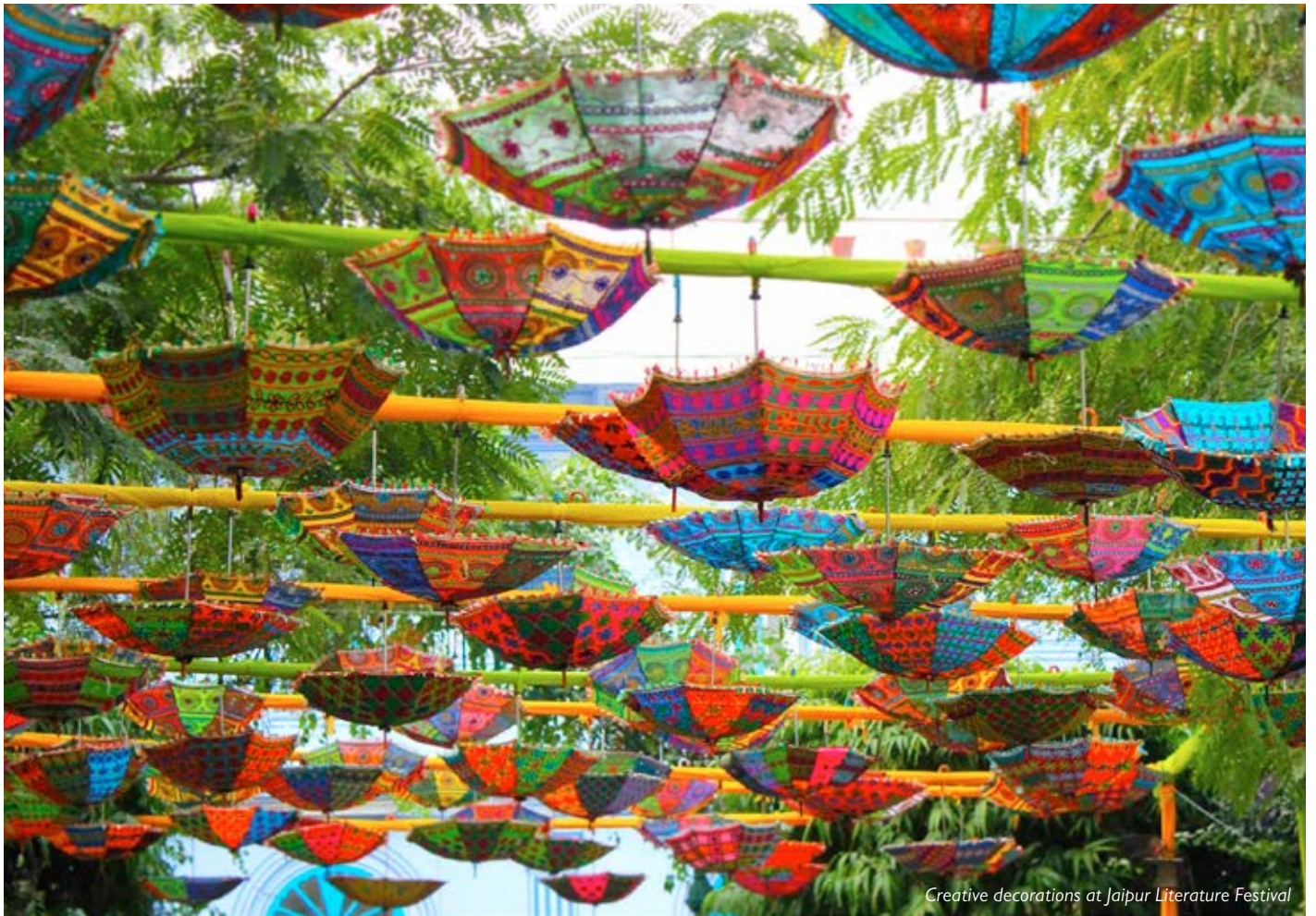
Creative decorations at Jaipur Literature Festival