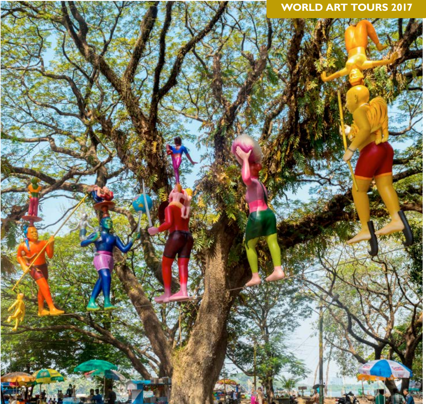
Gulammohammed Sheikh's Balancing Act (2014) at Vasco da Gama Square, Fort Kochi.