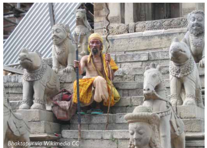
Bhaktapur

After a morning talk on Tenzing Norgay and the history of Darjeeling, visit the Himalayan Mountaineering Institute, established by Prime Minister Nehru after Tenzing Norgay climbed Everest in 1953 to encourage Indians to take up mountaineering.