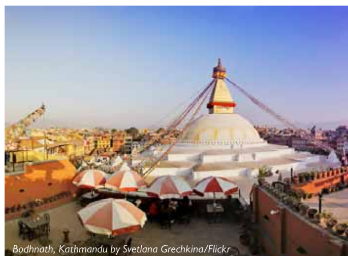
Bodhnath, Kathmandu

This afternoon visit to the Boudhanath Stupa, which for centuries has been an important place of pilgrimage and meditation for Tibetan Buddhists & local Nepalis. It is located on what was a major trade route between Nepal and Tibet. Many travelling merchants used it as a resting place. In 1979, Boudha became a UNESCO World Heritage Site. The Great Stupa of Boudhanath is the focal point of the district and the local Tibetan and Sherpa community can be seen each morning and evening making a kora or round of the stupa. Lunch at Boudhanath. B L