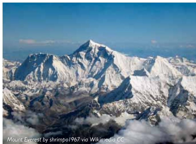
Mount Everest

This afternoon head for a visit to the great Paro Dzong and the Paro Museum (Ta Dzong) – one of Asia's best. Dzongs are large monastery forts which dominate every major town in Bhutan. They are the administrative and religious centres of the district and were once the mainstay of that districts' defences against invading Tibetans and often, rival Bhutanese clans. Ta Dzong houses a wonderful collection of art, armoury, weaponry and textiles and is a beautifully maintained showcase of Bhutanese history. The evening enjoy a talk on the history of Bhutan and enjoy some Bhutanese hospitality. B L D