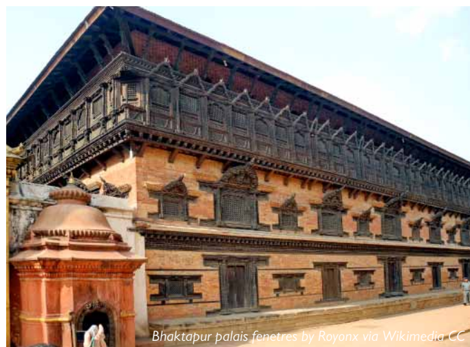
Bhaktapur palais fenetres

Visit the National Textile Museum which showcases Bhutan's world class textile arts and the Heritage Museum – a restored mid-19th century traditional farmhouse. B L D