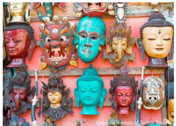
Colourful markets of Durbar Square