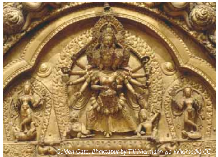
Golden Gate, Bhaktapur