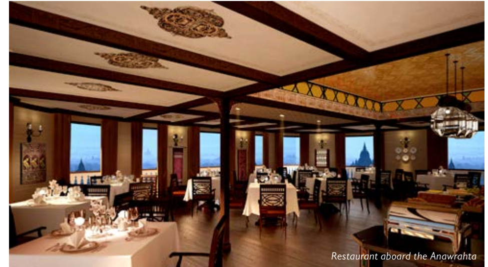
Restaurant aboard the Anawrahta

The Anawrahta features the Kipling bar, elegant Hinthia Hall Restaurant, the Mandalay Lounge and a full-length sun deck with deck-chairs, jacuzzi pool and navigation bridge. Other services include a gym and a spa.