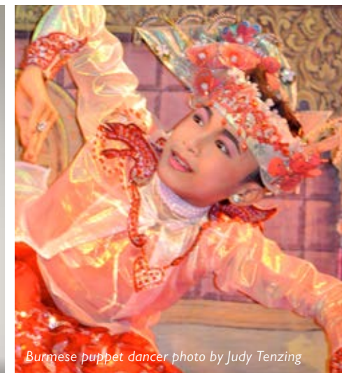
Burmese puppet dancer