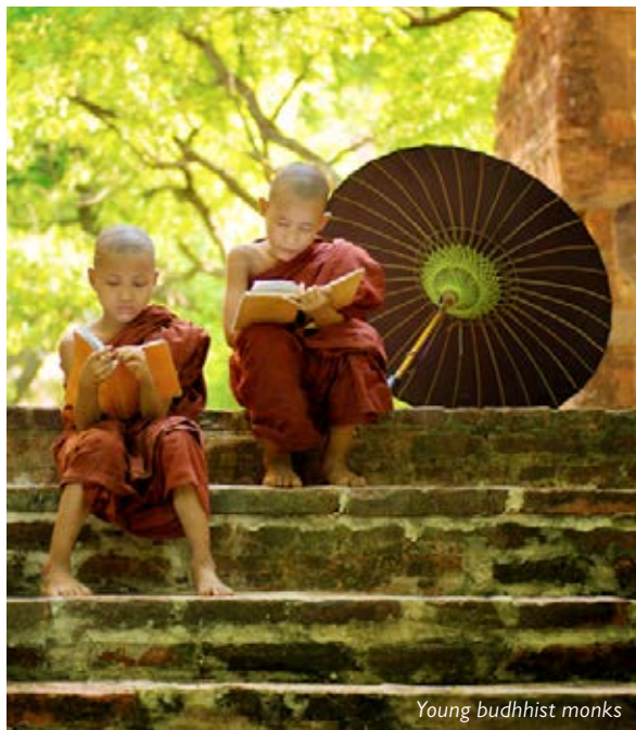
Young buddhist monks