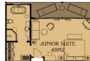
Junior Suite layout