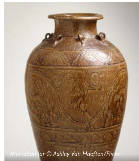
Martaban jar