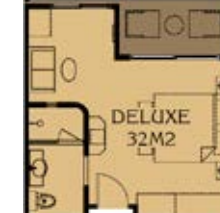
Deluxe Cabin layout