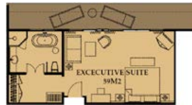
Executive Suite layout